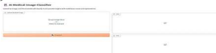
Fig1: Medical Image Classifier