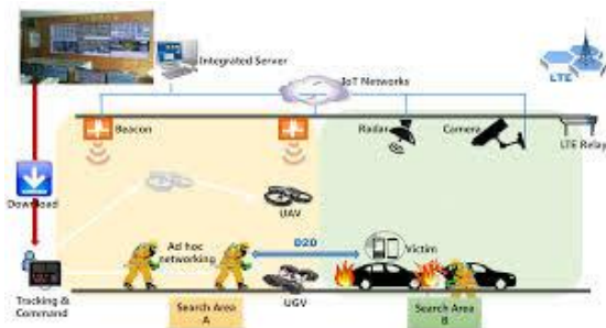
Fig 3: Integrated IoT and AI-Driven Search and Rescue Operations in Vehicle Emergencies

The overall architecture integrates these hardware, software, and data components into a cohesive system capable of detecting crashes, assessing severity, optimizing response, and facilitating communication between stakeholders throughout the emergency response process.